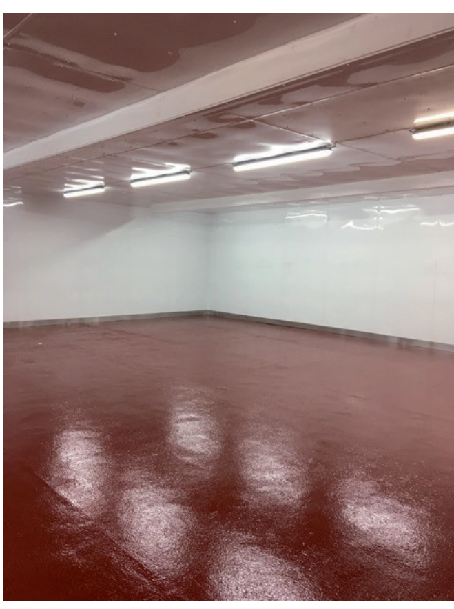
Project: Warehouse floor

Products used: Dampshield and ProFloor PLUS Cold Cure